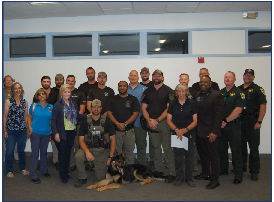
GGDFA & Alachua County Sheriff's Office K-9 Unit